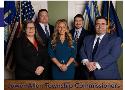
Lower Allen Township Commissioners

Public Hours: Monday - Friday 8:00am to 2:30pm